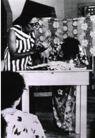
Figure 1: The kiss of life: Practical instruction for a village health worker in Samoa by R. J. Gobius

Unless it is your own work, the source must be acknowledged in full with a copyright attribution below the figure as a figure caption – See manual for more information