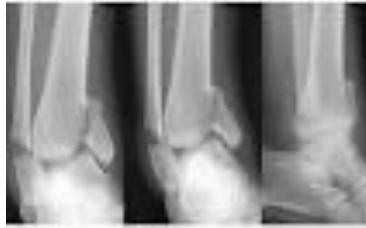
Figure 1: B2 fractures of the distal tibia

Figure 1 shows that ... (AO Foundation, 2004).